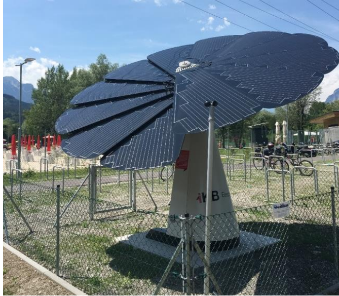
figure 1: Smart Flower close to public lake Baggersee