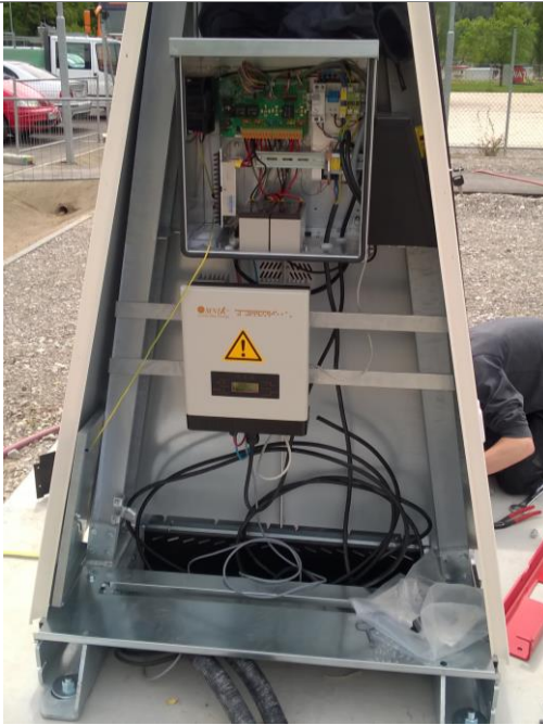
figure 3: Smart Flower control unit with GPS tracking