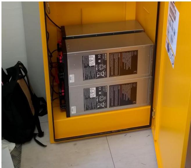
figure 2: lithium ion accumulator with 8 kWh capacity